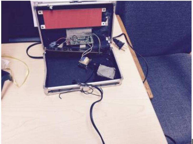
image of the clock, distributed by the Irving, TX police department. [12]